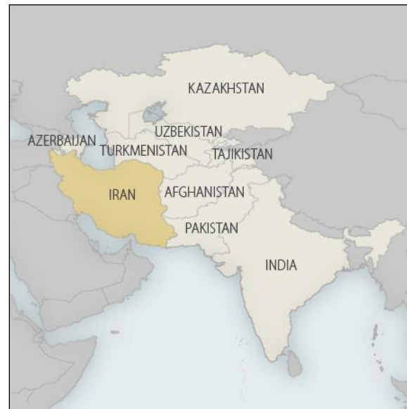
Figure 3. South and Central Asia Region

Most of the Central Asia states that were part of the Soviet Union are governed by authoritarian leaders. Afghanistan remains politically weak, and Iran is able to exert influence there. Some countries in the region, particularly India, seek greater integration with the United States and other world powers and tend to downplay cooperation with Iran. The following sections address countries that have significant economic and political relationships with Iran.