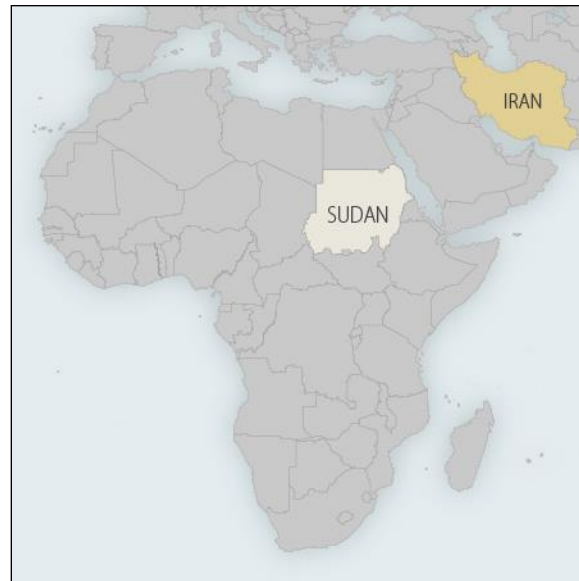
Figure 5. Sudan

Amid the Saudi-Iran dispute in January 2016 over the Nimr execution, several African countries that Iran had cultivated as potential allies broke relations with Iran outright, including Djibouti, Comoros, and Somalia, as well as Sudan. Senegal, at one time seen as a primary focus of Ahmadinejad's Africa outreach, and Sudan have supported the Saudi-led military effort against the Iran-backed Houthis in Yemen—in Sudan's case with some forces. 167 The UAE, in particular, has actively sought allies in the Horn of Africa to reduce Iranian influence, including by facilitating UAE operations against the Iran-backed Houthi rebels in Yemen. West Africa's large