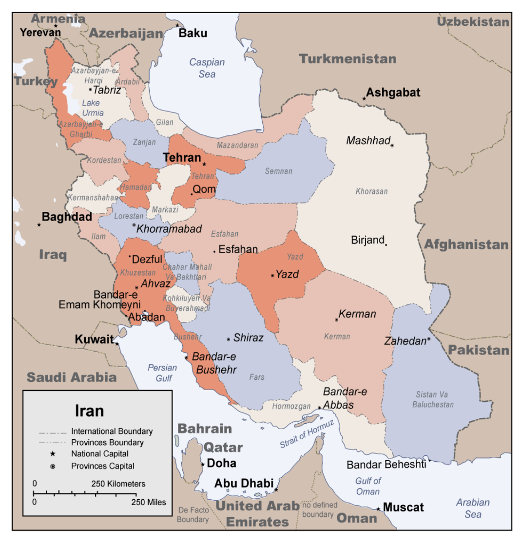
Figure 2. Map of Iran