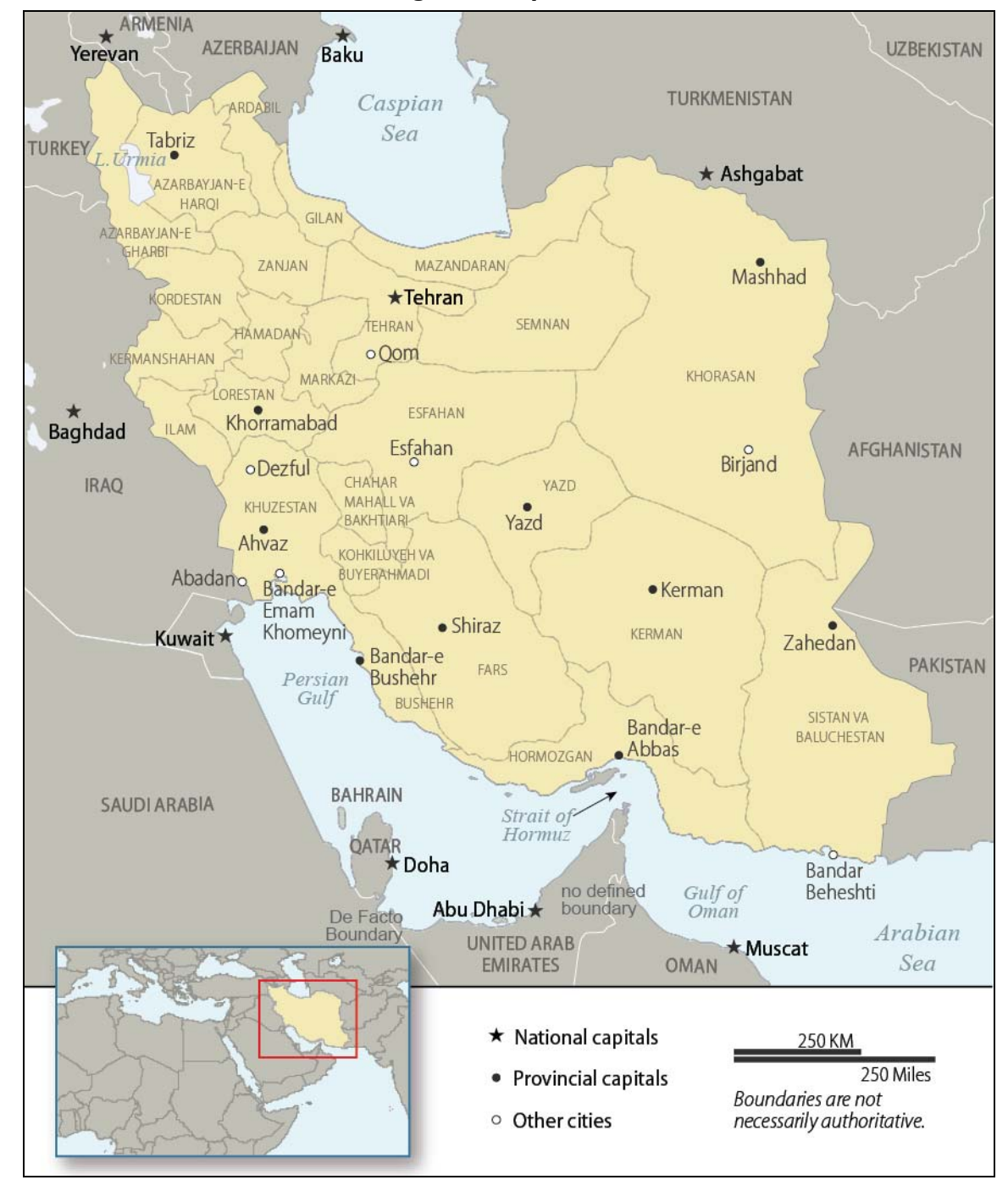
Figure 2. Map of Iran