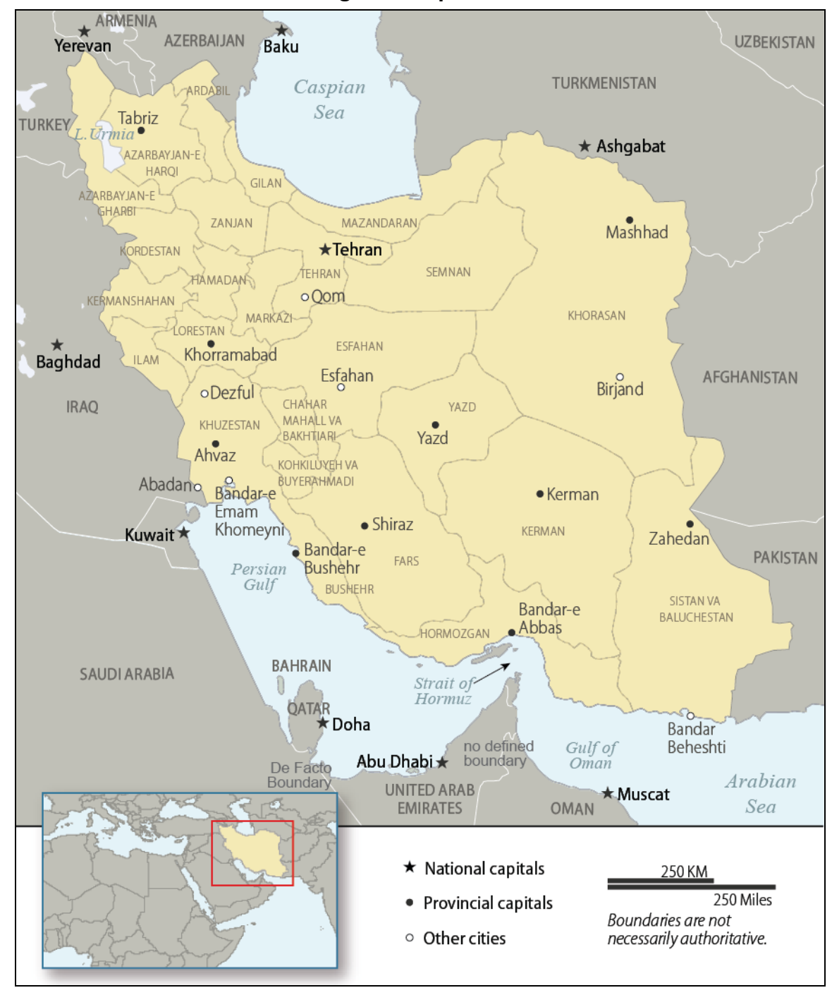
Figure 2. Map of Iran

Source: Map boundaries from Map Resources, 2005. Graphic: CRS.