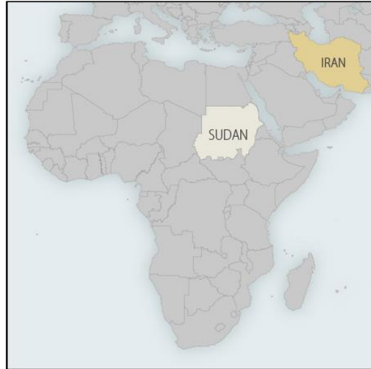
Figure 6. Sudan

The IRGC-QF has reportedly operated in some countries in Africa, in part to secure arms-supply routes for pro-Iranian movements in the Middle East but also to be positioned to act against U.S. or allied interests and to support friendly governments or factions. Several African countries have claimed to disrupt purportedly IRGC-QF-backed arms trafficking or terrorism plots. In May 2013, a court in Kenya found two Iranian men guilty of planning to carry out bombings in Kenya, apparently against Israeli targets. In December 2016, two Iranians and a Kenyan who worked for Iran's embassy in Nairobi were charged with collecting information for a terrorist act after