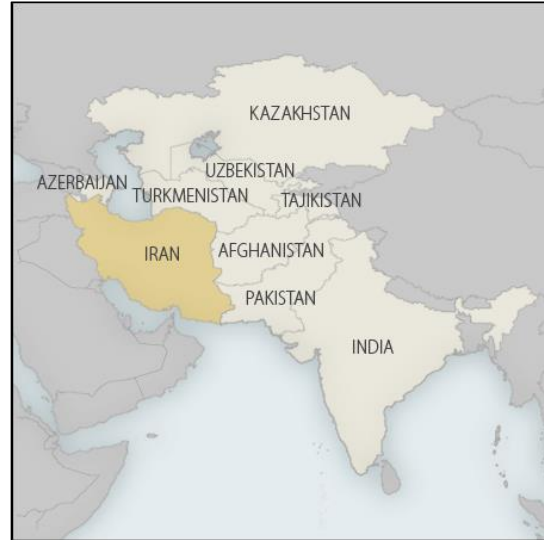
Figure 4. South and Central Asia Region

Most of the Central Asia states that were part of the Soviet Union are governed by authoritarian leaders. Afghanistan remains politically weak, and Iran is able to exert influence there. Some countries in the region, particularly India, seek greater integration with the United States and other world powers and tend to downplay cooperation with Iran.