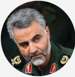
IRGC Major General Qasem Soleimani