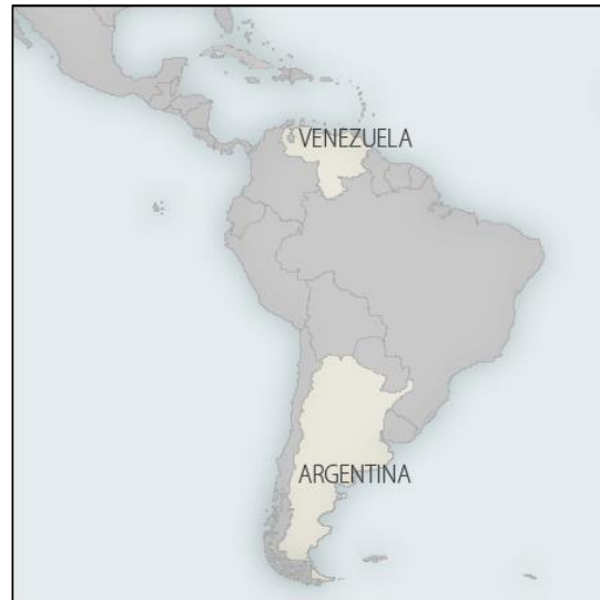
Figure 5. Latin America

The countries in which Iran appears to have sought to exert influence or retain the option for terrorist attacks include Venezuela, Argentina, and Cuba. U.S. counterterrorism officials also have stated that the tri-border area of Argentina, Brazil, and Paraguay is a “nexus” of arms, narcotics and human trafficking, counterfeiting, and other potential funding sources for terrorist organizations, including Hezbollah. Assertions in 2009 by some U.S. officials that Iran was significantly expanding its presence in Nicaragua were disputed by subsequent accounts. 164 In the 112 th Congress, the Countering Iran in the Western Hemisphere Act (H.R. 3783, P.L. 112-220) required the Administration to develop a strategy to counter Iran’s influence in Latin America, which was provided to Congress in June 2013. 165