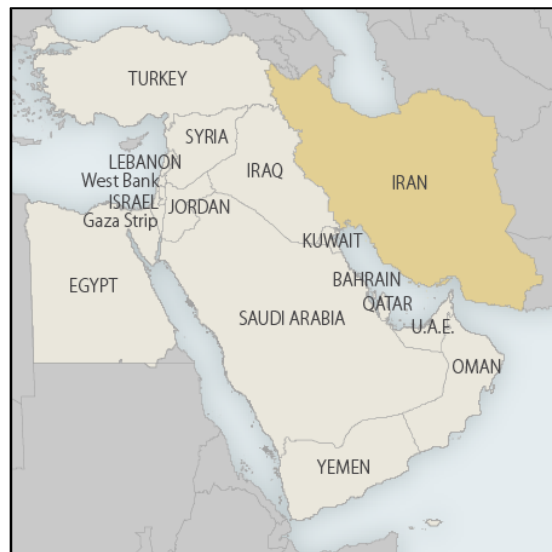
Figure 2. Map of Near East

Iran has a 1,100-mile coastline on the Persian Gulf and Gulf of Oman, and exerting dominance of the Gulf has always been a key focus of Iran’s foreign policy, including during the reign of the Shah. In 1981, perceiving a threat from revolutionary Iran and spillover from the Iran-Iraq War that began in September 1980, six Gulf states—Saudi Arabia, Kuwait, Bahrain, Qatar, Oman, and the United Arab Emirates—formed the Gulf Cooperation Council alliance (GCC). U.S.-GCC security cooperation expanded during the 1980-1988 Iran-Iraq War and became formalized after the 1990 Iraqi invasion of Kuwait. Prior to 2003, the extensive U.S. presence in the Gulf was in large part to contain Saddam Hussein’s Iraq but, with Iraq militarily weak since Saddam’s ouster, the U.S. military presence in the Gulf focuses primarily on containing Iran and conducting operations against regional terrorist groups.