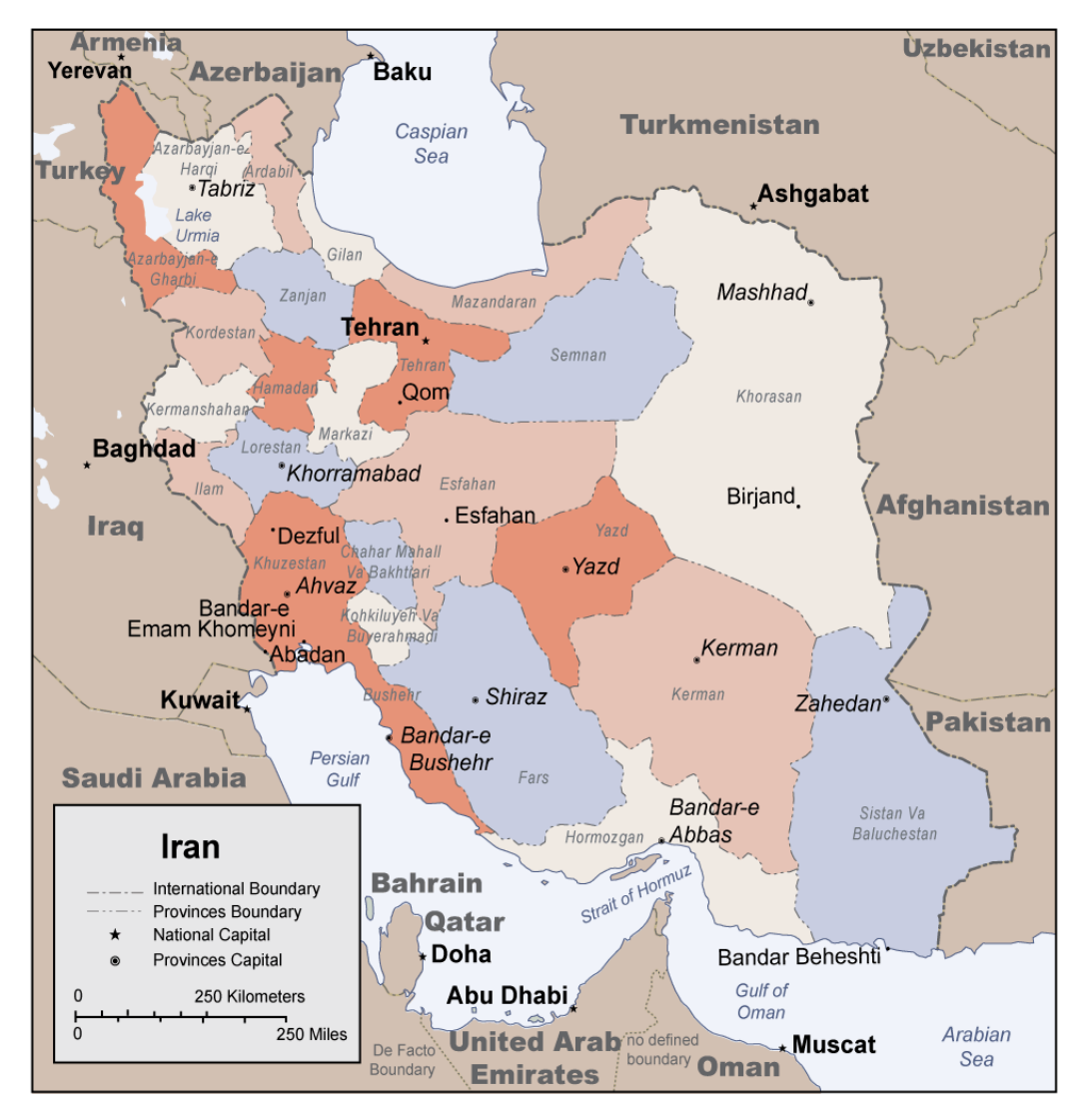
Figure 2. Map of Iran