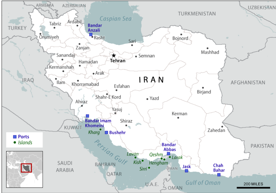
Figure 2. Iran, the Persian Gulf, and the Region