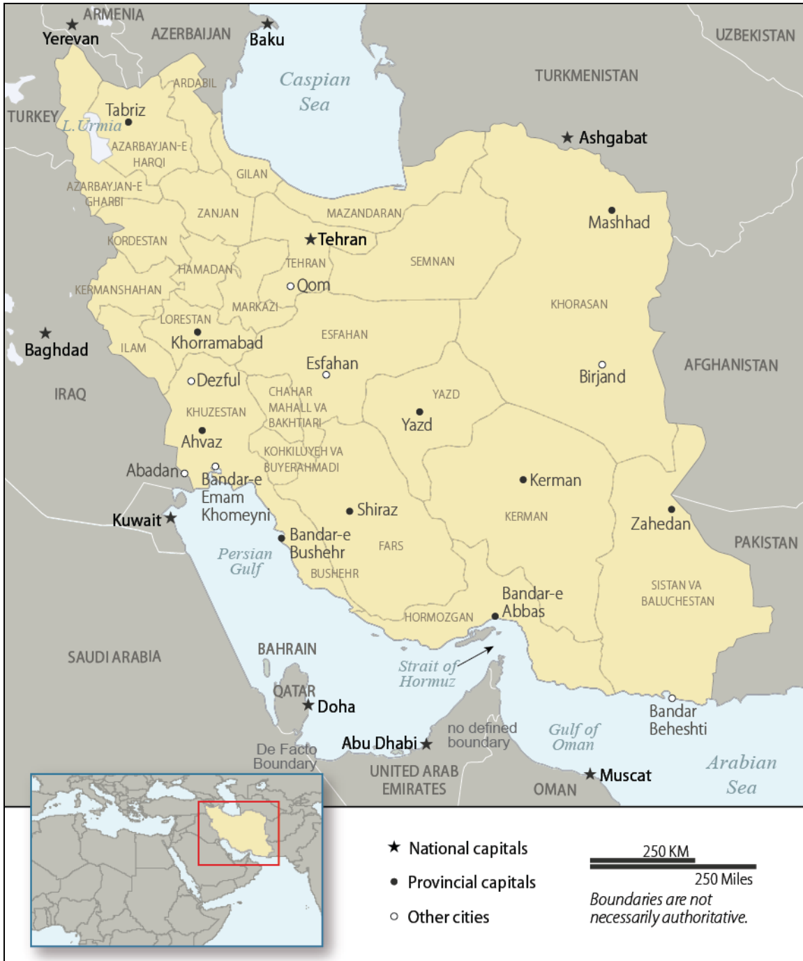
Figure 2. Map of Iran