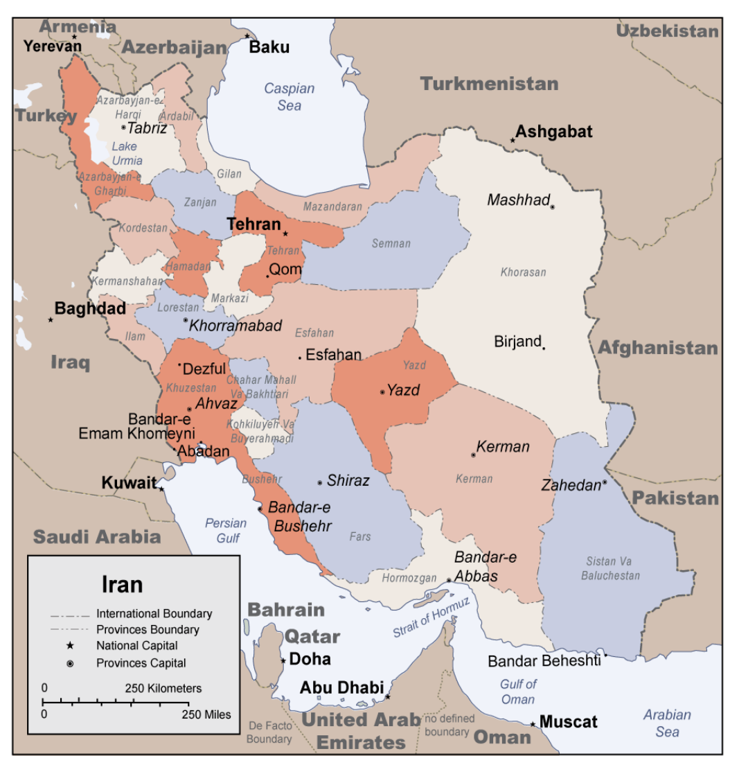
Figure 2. Map of Iran