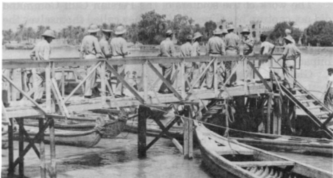
A group of U.S. senators inspects Iranian waterfront installations developed to speed the flow of American supplies to Russia, (Office of Technical Information)

Other construction supported the main effort on the transportation routes. The first projects concentrated on the expansion of the ports. At the docks on the gulf, as with the roads, shortages of equipment and materials led to improvisation and the search for supplies. For example, the long piles that were needed for jetties in the extremely fluid coastal soils were spliced together from teak piling purchased in India. Later came the vehicle assembly plants at Khorramshahr and Andimeshk, where trucks destined for service in the Red Army were put together from major components shipped from the United States.