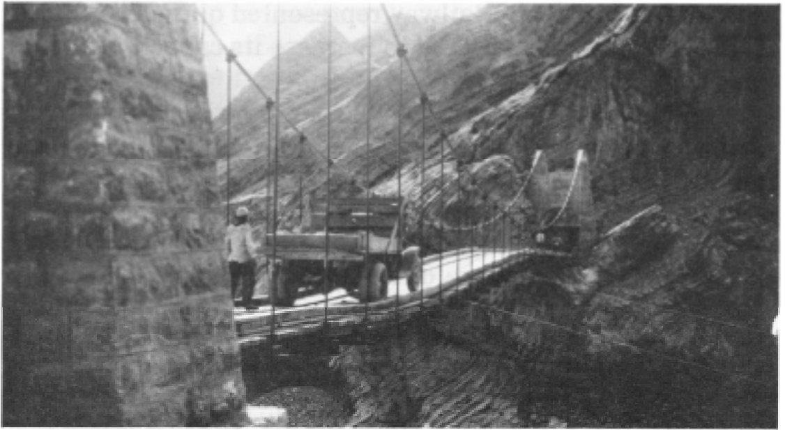
A Persian Gulf Command service road bridges a gorge at Talehzang, north of Dezful.

Bridges on the main highway were all permanent. They were designed to make use of whatever materials were available. Because the old salvaged steel beams came in various sizes, bridges were designed to fit the beams, rather than the other way around. All fabrication was done on site, with extensive electric welding. Abutments of gravity type mass concrete were placed, while piers, beams, and deck slabs were formed of reinforced concrete. Decks themselves were 26 feet wide between curbs.