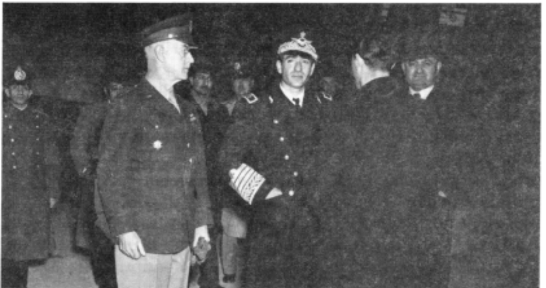
His Royal Highness, the Shah of Iran (center).

Other nations that were already embroiled in the war in Europe did not share American ignorance. In August 1941, Great Britain and the Soviet Union, longtime competitors for dominance in the Persian Gulf and Afghanistan, jointly occupied Iran, which seemed inclined to support Germany. The Soviets controlled the area north of the capital city of Teheran, Britain took the south, and they jointly held Teheran. The treaty that legitimized the division in September 1941 guaranteed Iranian neutrality for the duration of the war and the end of the occupation within six