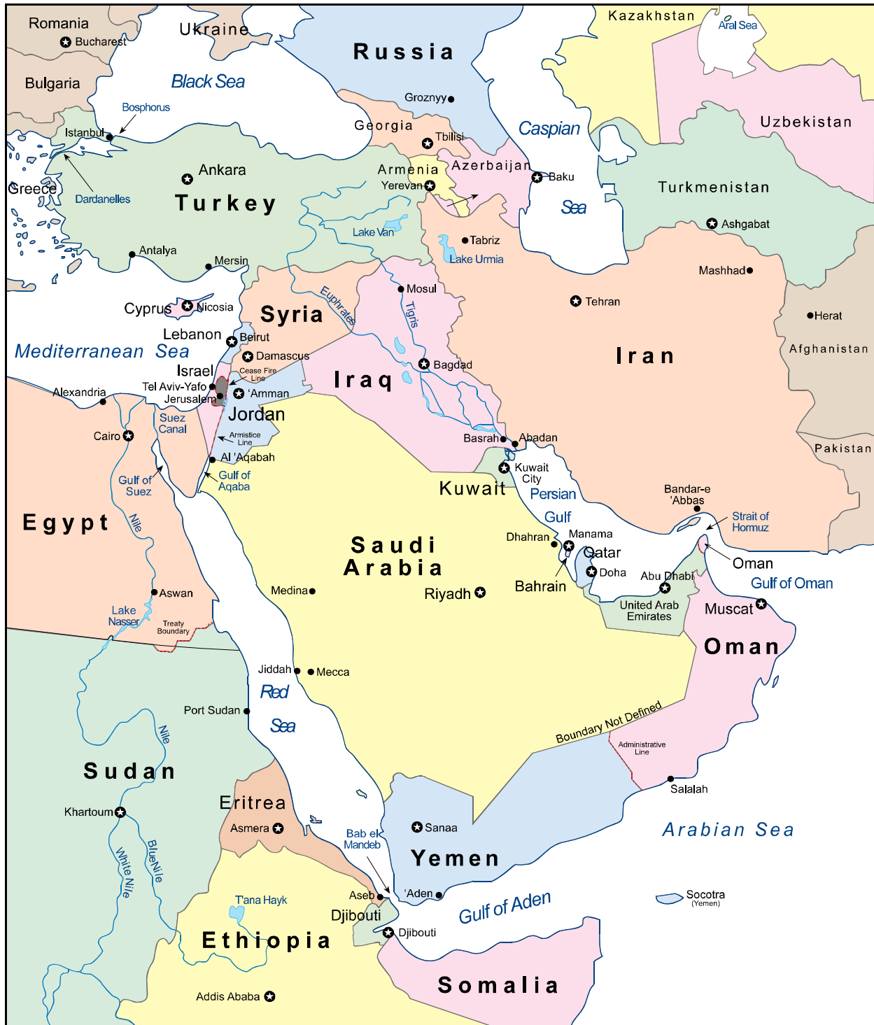
Adapted by CRS from Magellan Geographix. Used with permission.