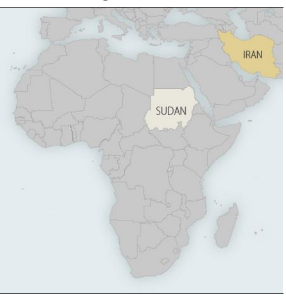
Figure 5. Sudan

The overwhelming majority of Muslims in Africa are Sunni, and Muslim-majority African countries have tended to be responsive to financial and diplomatic overtures from Iran's rival, Saudi Arabia.