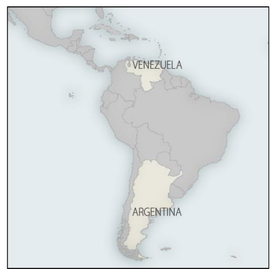
Figure 5. Latin America

In the 112<sup>th</sup> Congress, the Countering Iran in the Western Hemisphere Act, requiring the Administration to develop a strategy to counter Iran's influence in Latin America,