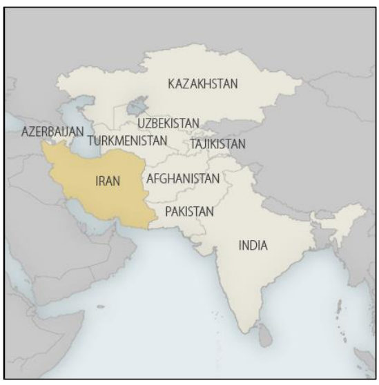
Figure 4. South and Central Asia Region

Most of the Central Asia states that were part of the Soviet Union are governed by authoritarian leaders. Afghanistan remains politically weak, and Iran is able to exert influence there. Some countries in the region, particularly India, seek greater integration with the United States and other world powers and tend to downplay cooperation with Iran. The following sections address countries that have significant economic and political relationships with Iran.