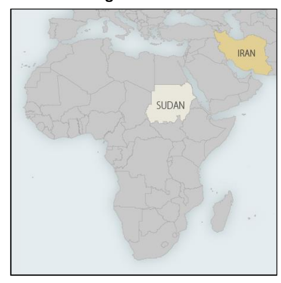
Figure 6. Sudan

The overwhelming majority of Muslims in Africa are Sunni, and Muslim-majority African countries have tended to be responsive to financial and diplomatic