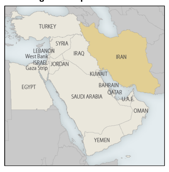
Figure 2. Map of Near East

Iran has a 1,100-mile coastline on the Persian Gulf and Gulf of Oman, and exerting dominance of the Gulf has always been a key focus of Iran's foreign policy—even during the reign of the Shah of Iran. In 1981, perceiving a threat from revolutionary Iran and spillover from the Iran-Iraq War that began in September 1980, the six Gulf states formed the Gulf Cooperation Council alliance (GCC: Saudi Arabia, Kuwait, Bahrain, Qatar, Oman, and the United Arab Emirates). U.S.-GCC security cooperation expanded during the 1980-1988 Iran-Iraq War and became more institutionalized after the 1990 Iraqi invasion of Kuwait. Prior to 2003, the extensive U.S. presence in the Gulf was in large part to contain Saddam Hussein's Iraq but, with Iraq militarily weak since Saddam's ouster, the U.S. military presence in the Gulf focuses primarily on containing Iran and