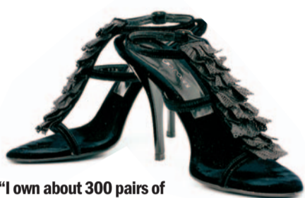
“I own about 300 pairs of shoes, and this pair from Sergio Rossi is one of my favorites because it is timeless, elegant, sexy, yet funky. My favorite shoe designer is Christian Louboutin — he is a fantastic designer and a lovely person.”

Magazines: British and Italian Vogue , L’Official , Surface , ID , WWD and Wallpaper