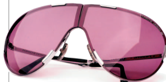
“I’m never without sunglasses. This Porsche pair belonged to my mother.”