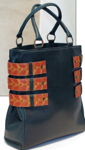
Leather embroidered tote, $580

3 Go for quality instead of quantity. Don’t do knockoffs or imitations, buy the original. Recognize which companies are good at making certain types of products, and what their specialties are.