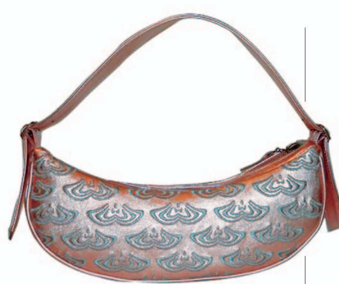
Garrigue & Jarossay metallic evening bag, $360, from a collection at Premium 93 and Studio Sebastian; Kirna Zabête, New York; or www.garriguejarossay.com