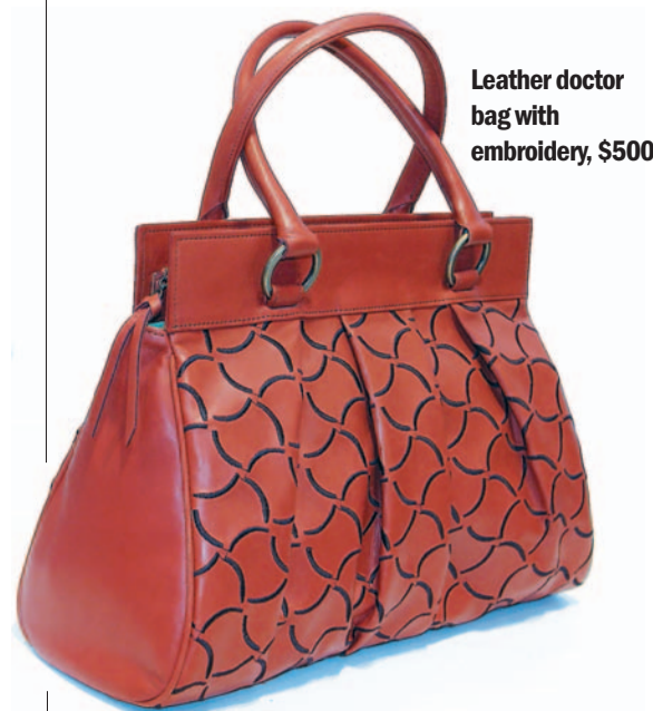
Leather doctor bag with embroidery, $500