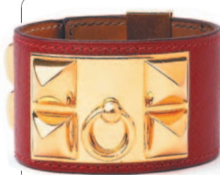
Hermès “Collier de Chien” cuff in Rouge Hermès, the first color the company used on handbags and its signature leather color — not orange.

“The Royal Tenenbaums, Amélie, In the Mood for Love (in every scene she has the same cut dress but in different fabric patterns and colors), Blue Velvet, Henry and June, all of The Pink Panther films (so funny) and, of course, all of the James Bond movies.”